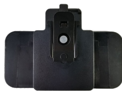
Chest Mount ORB33X