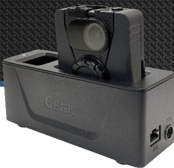
Single-Unit Charging Dock

The latest Getac Body-Worn Camera delivers ultra-wide angle, full HD video, even in low-light conditions. With 4G LTE capabilities ~16-20 hours of battery life with a second battery and a wide range of communication features, it can go wherever the action is, providing complete situational awareness in critical scenarios.