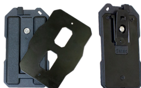
Magnetic Mount Single-ORB36X Dual-ORB41X