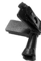
Swivel Mount ORB43X