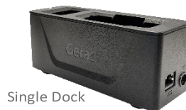
Single Dock VD-03 ORB27X