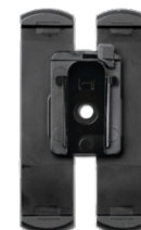
Molle Mount ORB34X