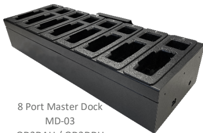
8 Port Master Dock MD-03 OD3DAU / OD3DDU

Warranty: 1 Year Standard limited warranty*. Extended plans available.