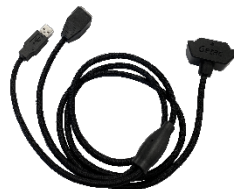
Magnetic Charging Cable ORB42X