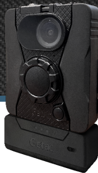
Swappable Secondary Battery