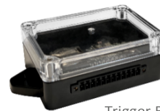
Trigger Box OTX11X